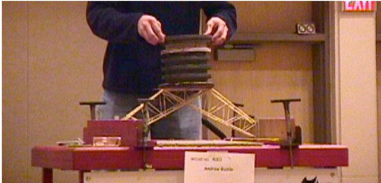
Figure 1 – Competition Table in Use

Each abutment can be clamped to the table at any point along the table's length. When students elect to build a bridge with a horizontal bottom chord, the required span is developed by clamping the abutments with the span length between them, and resting the bridge atop the abutments. When the student builds a bridge that incorporates the span, the abutments can be clamped in place so as to make direct contact with the base of the bridge, providing lateral thrust support.